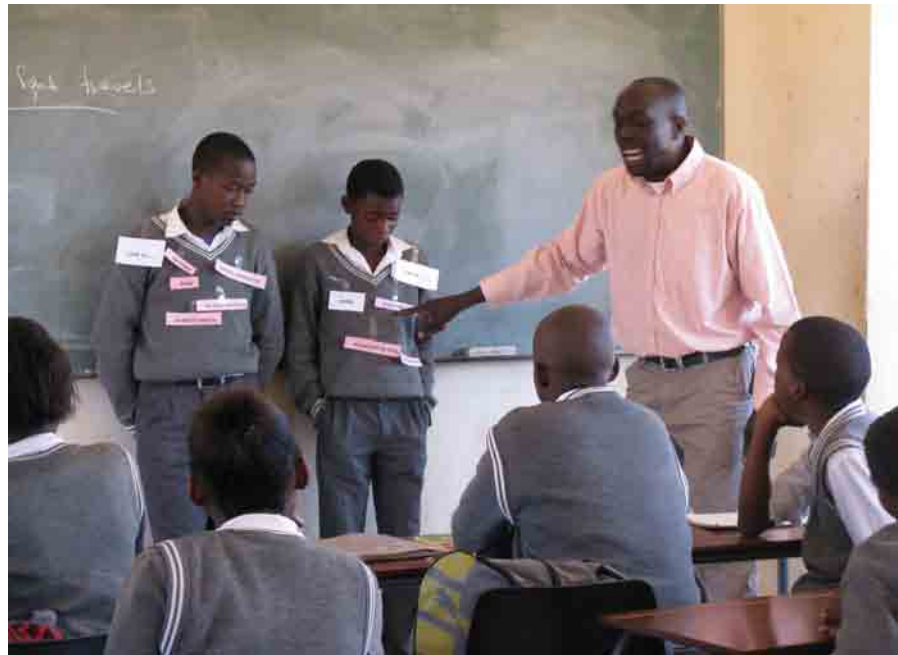
France presenting to the grade 8 & 9 learners

received requests to continue to the program at the other local schools.